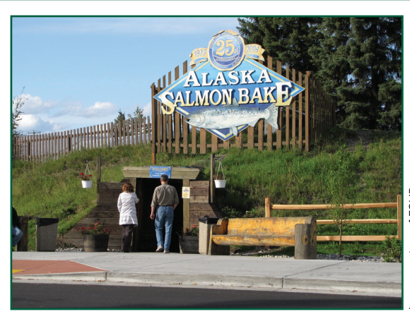
The Alaska Salmon Bake is a popular spot for visitors.

Cray Inc. will host a social on Tuesday evening at 6:00 PM at the Alaska Salmon Bake in Pioneer Park. All conference participants and their guests are invited to attend. The all-you-can-eat buffet features salmon, halibut, Bering Sea cod, crab, prime rib, side dishes and dessert. The local band, Celtic Confusion, will provide music. An indoor pavilion has been reserved for exclusive use by CUG. Take time to walk around the park, take a train ride, visit the old cabins or visit the Pioneer Air Museum. Pioneer Park, previously called Alaskaland, was the site of the 1995 Fall CUG Conference.