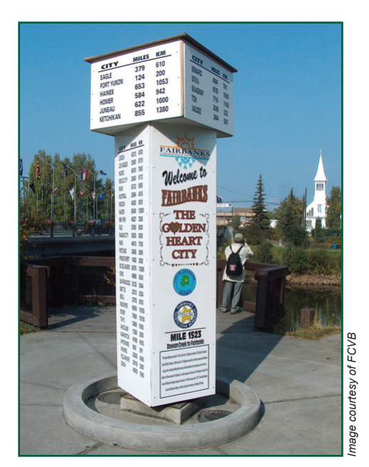
The milepost at Golden Heart Plaza can help you figure out how far Fairbanks is from your home.