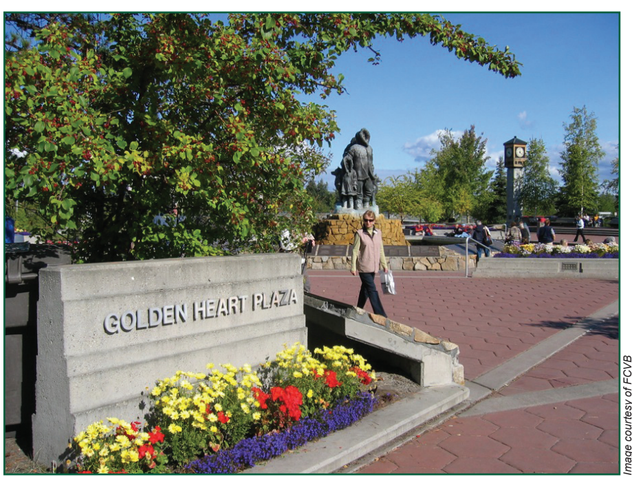
Visitors enjoy a sunny stroll through the Golden Heart Plaza in downtown Fairbanks.

Please come to the Conference Office if you need assistance.