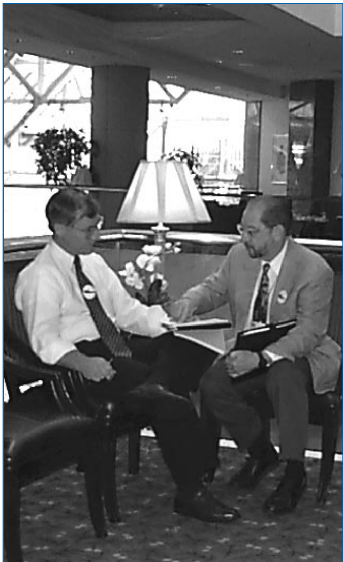
CUG members find time to help each other one-on-one.