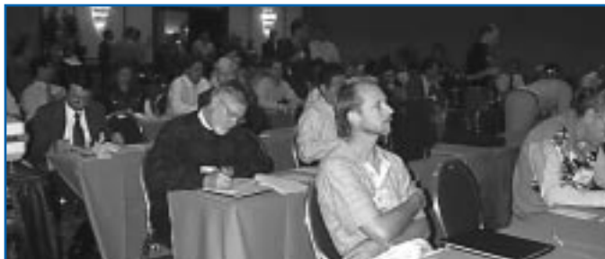
Attendees at CUG conferences learn new technologies.

The CUG Site List is an important source of information for CUG sites that are willing to share information and experiences on issues like mass storage, tuning, priority scheduling, security, multitasking, networking, and distributed computing. The Site List is updated and distributed on a regular basis to CUG members and conference attendees.