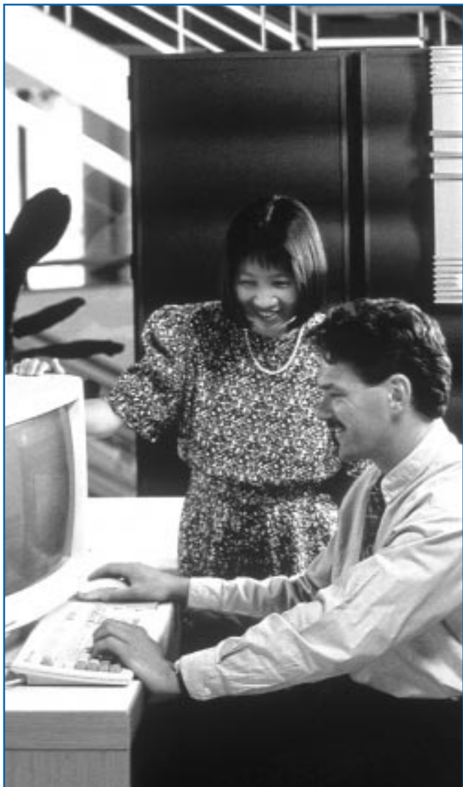
CUG members use what they learn to help each other.