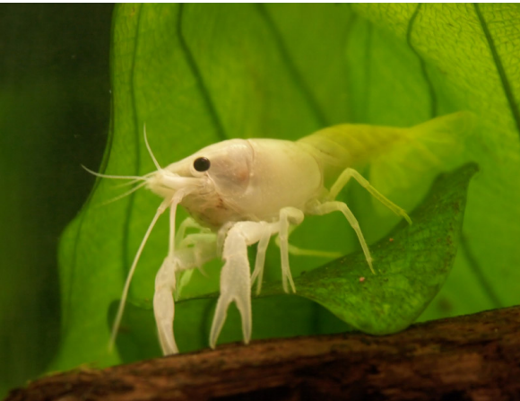
Flickr users Jeroen Rouwkema